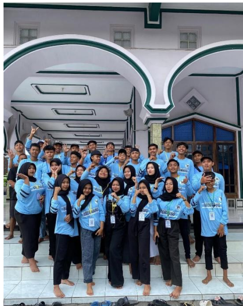
Picture 2 Pengurus dan Anggota Remaja Masjid Anisul Muttaqin