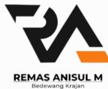
Picture 1 Logo Remaja Masjid Anisul Muttaqin

The youth members of the Anisul Muttaqin Mosque in Bedewang Village, Banyuwangi Regency, include junior high school and high school students, university students, and working-age youth. They are generally aged 13 to 25. The number of members ranges from 25, with varying levels of participation depending on the type of activity being held.